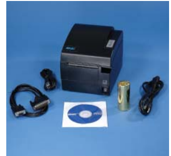
Includes Everything Necessary in the Carton