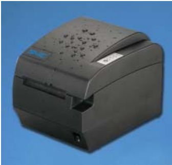
Spill-Proof Design is Especially Suitable for Kitchens and Bars