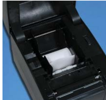
Drop and Print Paper Loading with an Adjustable Paper Width Selector