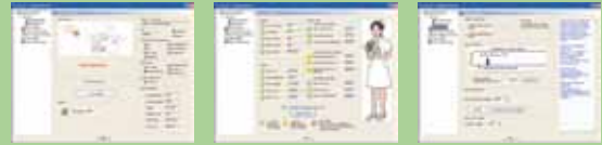
FULL STATUS MONITOR