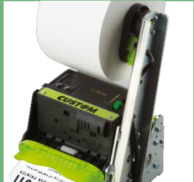
ETHERNET VERSION WITH WEB SERVER