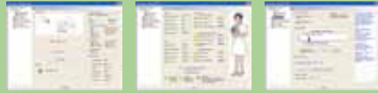
FULL STATUS MONITOR