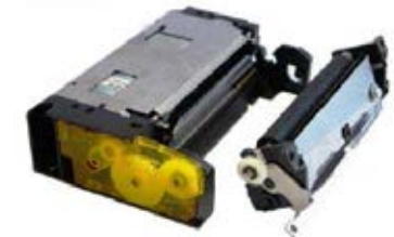
*HSP3208 Easy Loading Version

**under certain driving conditions & using recommended paper