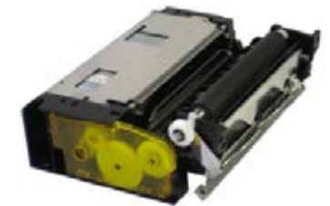
*HSP3208 Kiosk Version